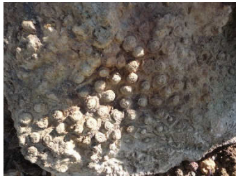
Coral